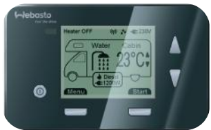
Digital control panel