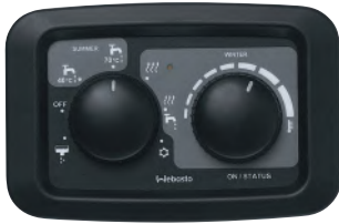
Standard control panel