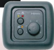
Diesel Cooker X 100 control